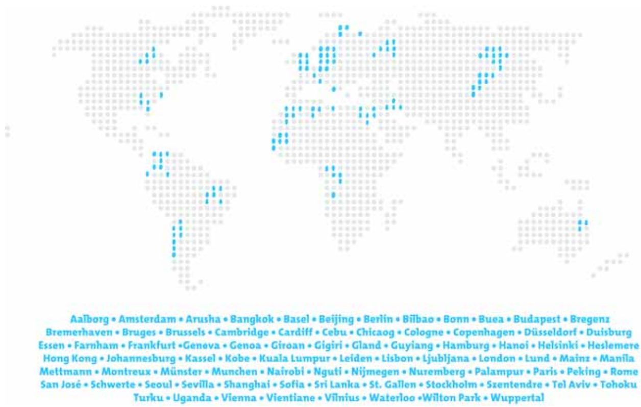
Figure: Location of CSCP's Activities

Furthermore, the CSCP is also actively hosting a multitude of conferences and workshops in close cooperation with partners. The year 2009 has been the most active yet. Some of the highlights in 2009 include