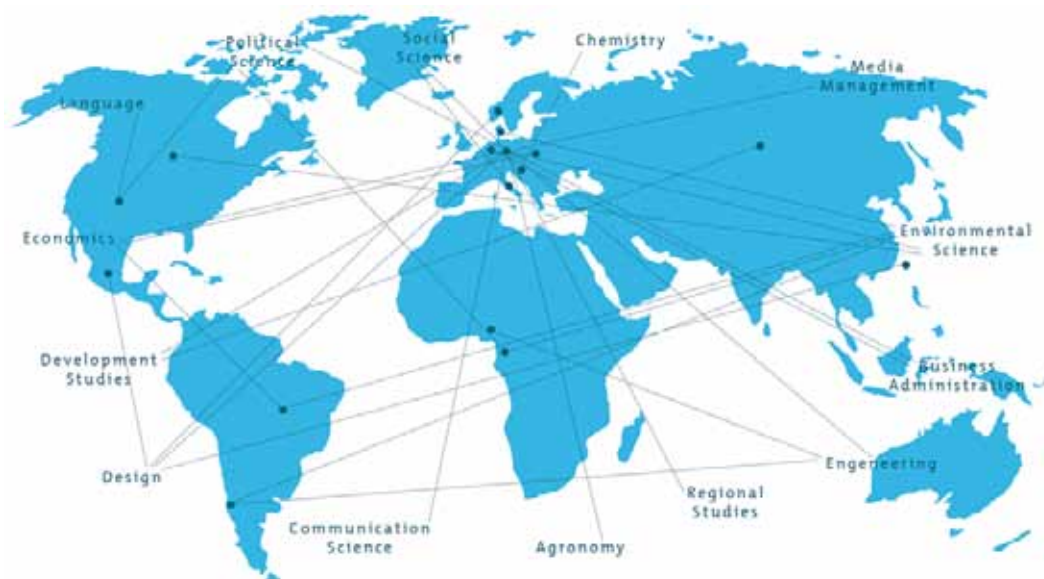
Figure: Disciplinary background and country of origin of former CSCP team members (Alumni, as of August 2009)

Since the CSCP was established in 2005, its alumni network has rapidly grown. As the Centre is an international institution, expertise from all over the world is needed in order to meet the challenge of promoting sustainable patterns of consumption and production worldwide. Therefore the CSCP has created a special "SCP Young Professional Outer Planet" programme to build the capacity of young professionals on Sustainable Consumption and Production. The young professionals come from all around the world and have been contributing to the Centre's activities with know-how from a broad scale of different speciality areas. The map below indicates countries of origin and different branch of study of CSCP's alumni network.