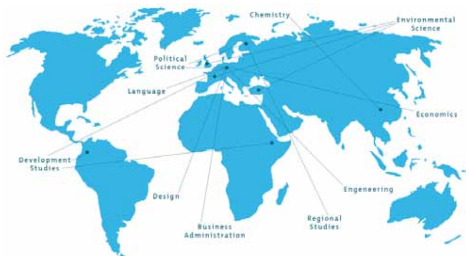
Figure: Disciplinary background and country of origin of current CSCP team members (Active Members, as of August 2009)